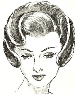
Horse Shoe effect finger wave.