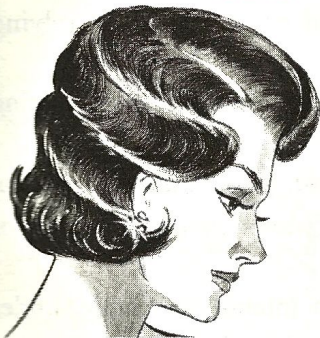
Side Part finger wave with fluff nape line.